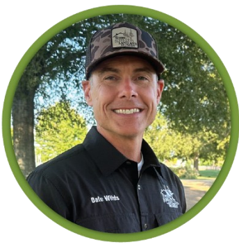
DALE WILDS REALTOR®

This 1,728± sq. ft. home features a large living room, dine-in kitchen with new appliances, a flexible 4th bedroom/office, and major updates including a new AC, 2-year old roof, and smart-home features. Outside, enjoy an 18x36 saltwater pool with a 2024 liner, a pool cabana with half bath, covered patio, climate-controlled storage building, and a large front and backyard. The property sits privately tucked away yet remains minutes from Hwy 49, with an additional 0.3± acre open area where deer frequently visit. With 2.12± measured acres (1.6± deeded), this one offers space, upgrades, and outdoor amenities rarely found together.