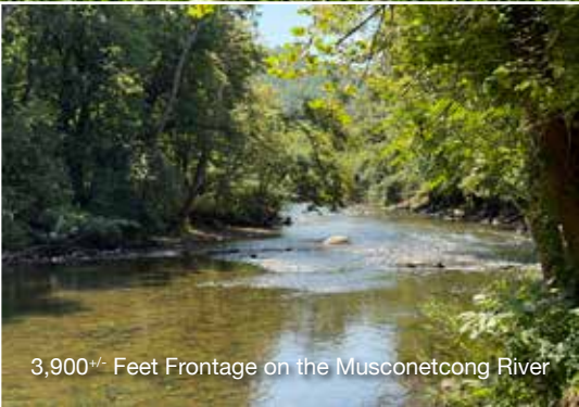
3,900± Feet Frontage on the Musconetcong River