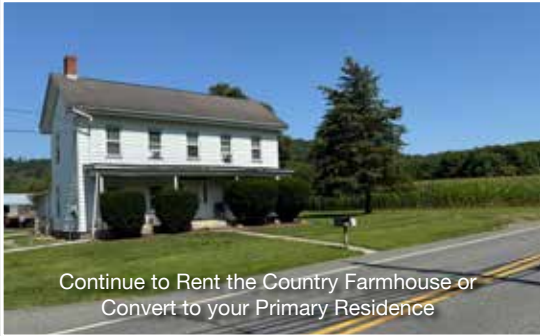
Continue to Rent the Country Farmhouse or Convert to your Primary Residence

Living in Pohatcong Township means embracing a quieter, rural lifestyle with easy access to nature and history. The township is part of Warren County, known for its rolling hills, preserved farmland, and strong community spirit. Pohatcong offers a peaceful retreat while still being close to major routes for commuting or weekend getaways. Residents enjoy a blend of small-town charm, outdoor recreation, and proximity to the Delaware River and historic towns like Riegelsville and Phillipsburg.