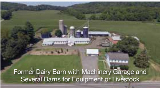
Former Dairy Barn with Machinery Garage and Several Barns for Equipment or Livestock