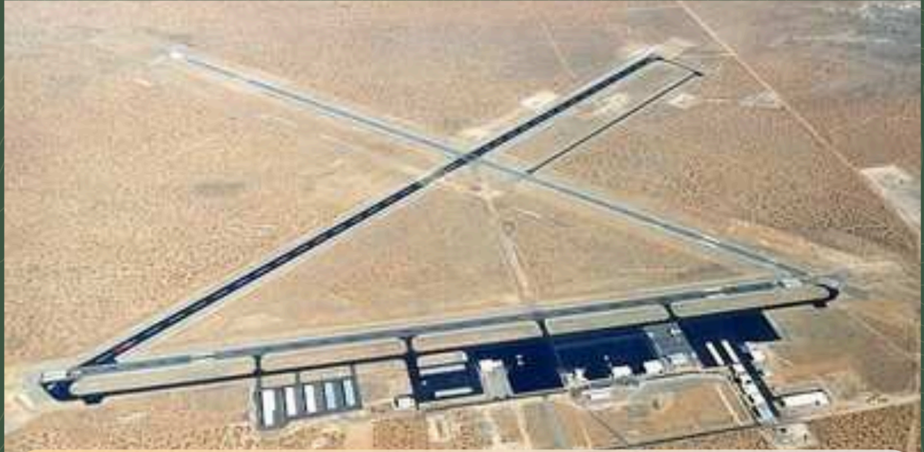
Las Cruces International Airport