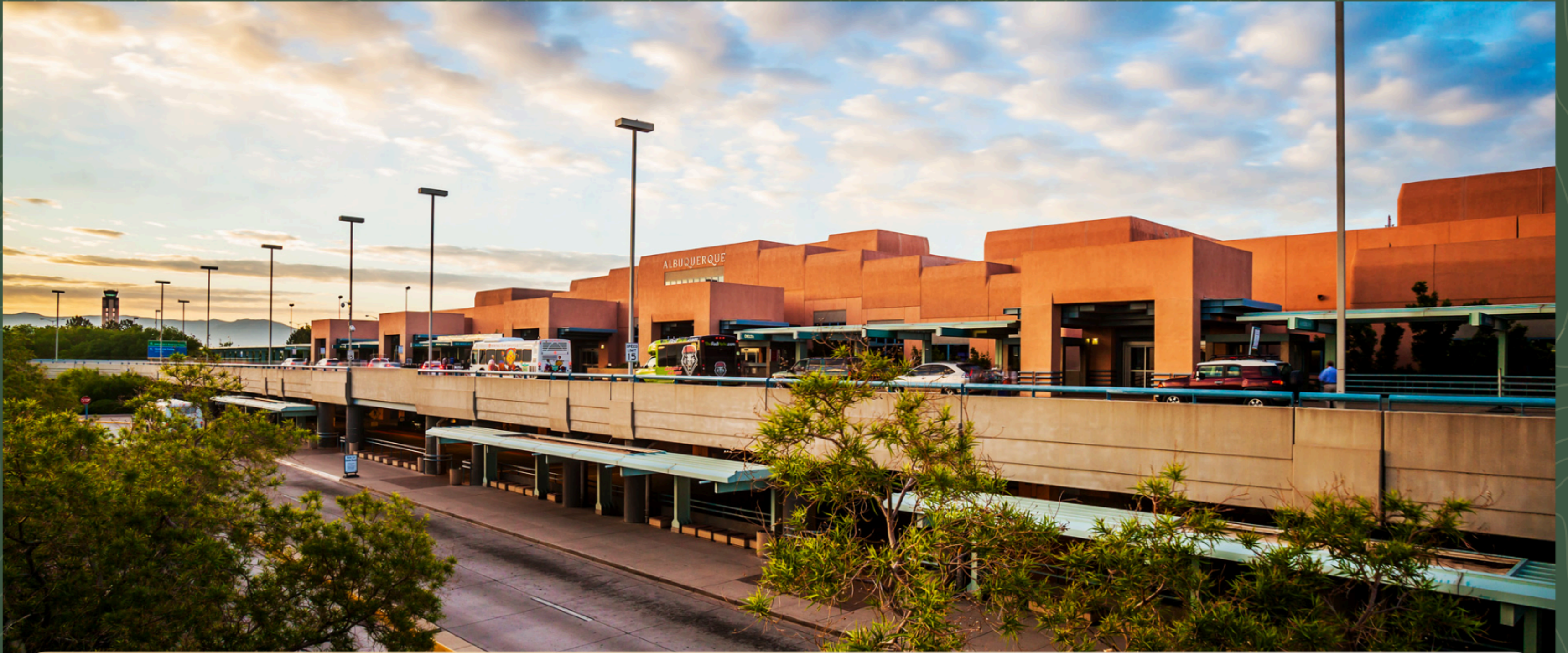
Albuquerque International Sunport