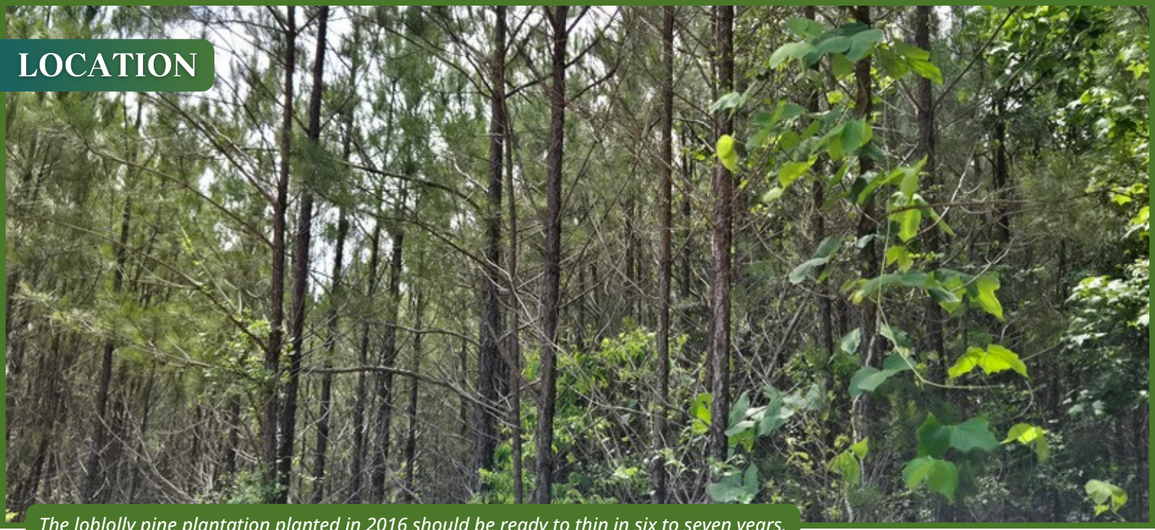
The loblolly pine plantation planted in 2016 should be ready to thin in six to seven years.

The Dickert Tracts are situated in the Piedmont region of Alabama, characterized by its rolling hills and valleys. It is surrounded by timberland on all sides. The town of Wadley is only a 7-mile drive west, offering convenience stores, fuel options, and a couple of local restaurants. The city of Roanoke is approximately 15 minutes east and provides dining, grocery shopping, and hotel accommodations. The Tallapoosa River is just four miles away, and Lake Wedowee can be reached within 20 minutes. Additionally, Atlanta Airport is about an hour and a half away.