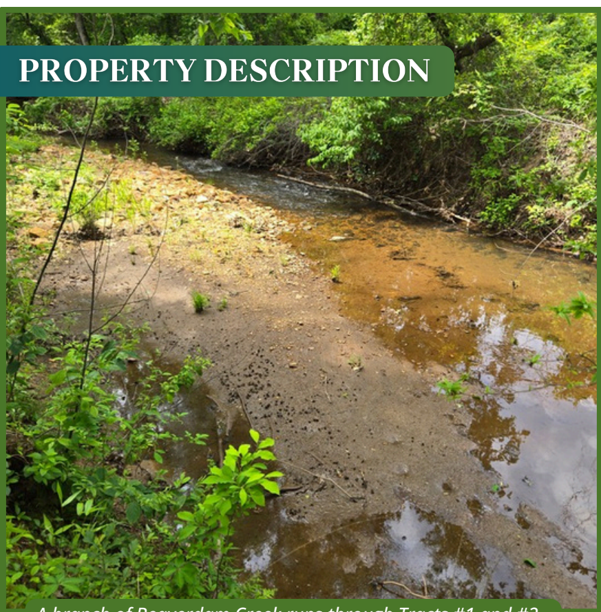
A branch of Beaverdam Creek runs through Tracts #1 and #2.

These tracts are ideal for recreational use due to their diverse timber types and their location within a larger forested area, which offers significant potential for future timber production. The terrain is gently rolling, with elevations ranging from approximately 680 to 900 feet above sea level.