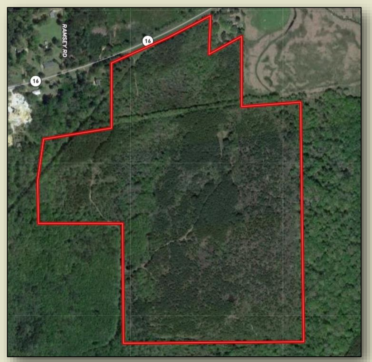
Carthage 166.8 acres Leake County, MS