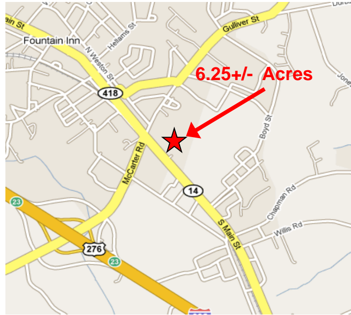
Property located on South Main Street in the City of Fountain Inn