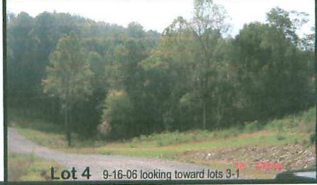
Lot 4 9-16-06 looking toward lots 3-1

Information is subject to change and is not guaranteed. 12-8-07