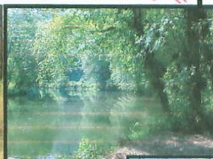
Lot 1 Creek Bend