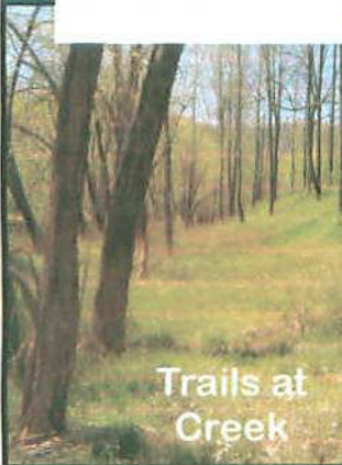
Trails at Creek