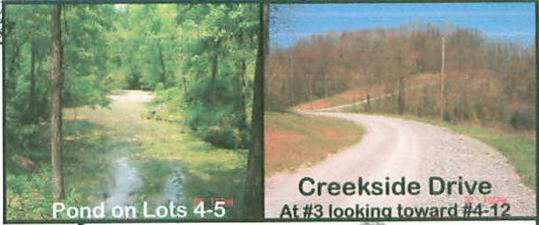
Pond on Lots 4-5 At #3 looking toward #4-12

From SR 7 & Bear Run Road: Go East on Bear Run for 1.4 miles to go right on Clay Chapel. Follow for 1.1 miles to Creek Side Drive on the right. Raccoon Creek goes under SR 7 near Bear Run Road.